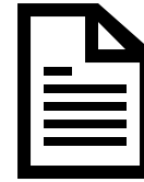
One Effort Report